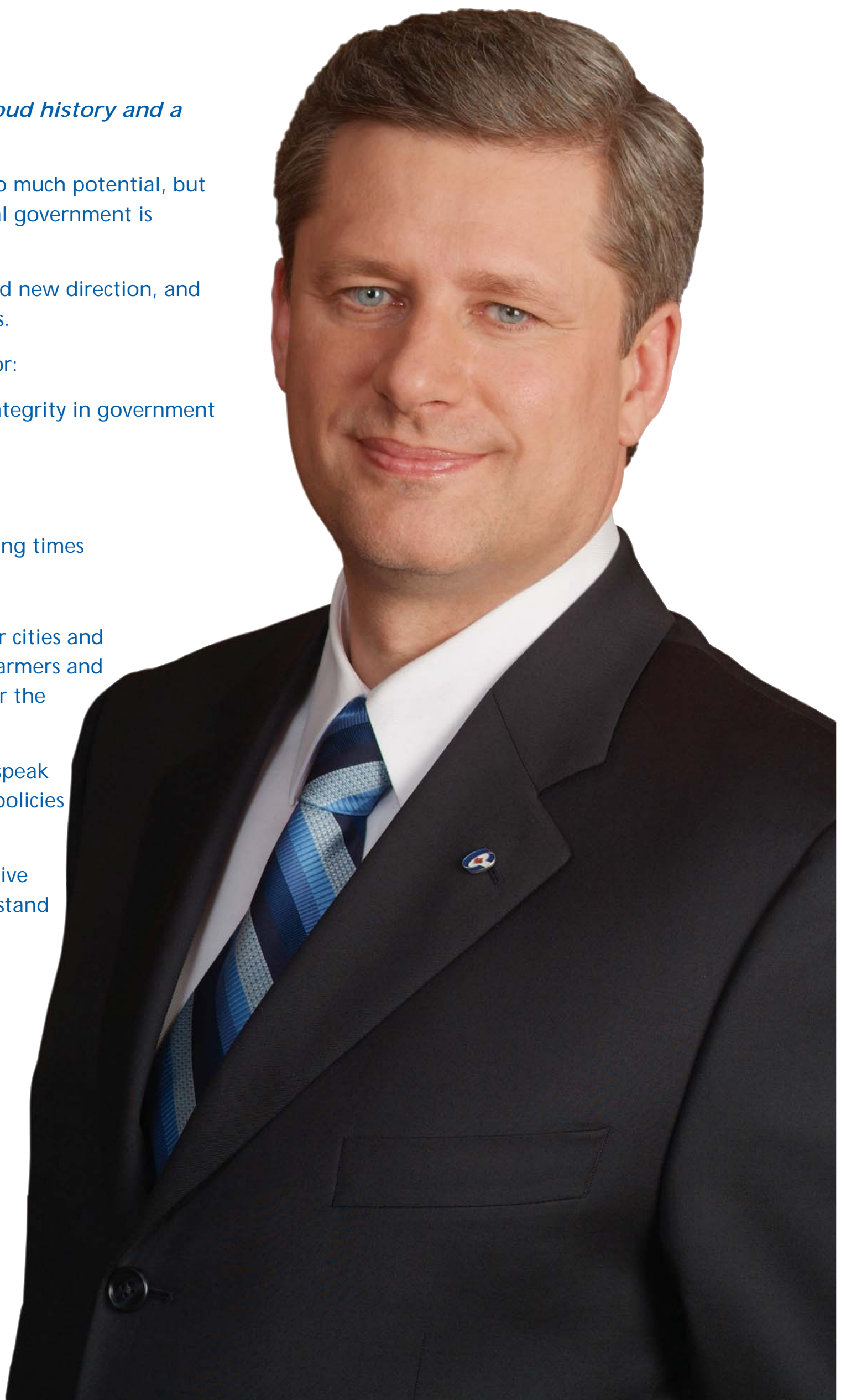
Hon. Stephen Harper, P.C., M.P. Leader of the Opposition Leader of the Conservative Party of Canada